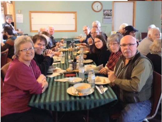
Sharing a meal, Fellowship, Making new friends