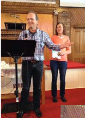
Chapter leaders sharing the past (2016), and Looking ahead (2017)