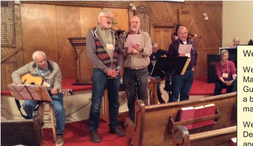
Friday night song leaders making a joyful noise unto the Lord

“Looking Ahead” – Glimpses from the conference