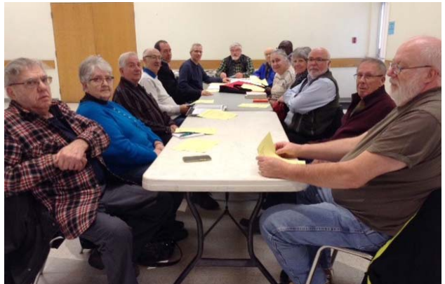
Ottawa regional meeting with reps from the following chapters: Lanark County, Renfrew County, Outaouais, Ottawa Valley, and Upper Ottawa Valley

This winter, opportunities were given to two groups to meet together, to share, to get to know one another, and thereby develop a team spirit in the region. On January 12 th a meeting was held in Carleton Place for the Ottawa region, and on the 16 th a similar meeting took place in Orangeville for the chapters in southwestern Ontario. It was a time to fellowship, sharing a meal, testimonies, and anecdotes. All participants seemed to feel it was time well spent. One participant, when discussing the advancing age of many of the delegates, exclaimed: “I propose we meet again next year and at that time we will each bring our ‘Timothy’ with us!”